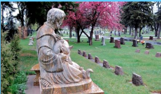
St. Francis Statue in Rosehill Memorial Cemetery

Their mission of caring for an individual as a whole still resonates today through Inspiritus Community Health Foundation. Inspiritus means "into life", "into soul", "into breathing." The mission of ICHF is to promote healthy and sustainable communities by providing financial gifts, strengthening collaborative relationships, and supporting local initiatives that impact the mental, physical, spiritual, and emotional well-being of residents in the counties of Bottineau, Burke, McHenry, McLean, Mountrail, Pierce, Renville, Rolette, Sheridan, Ward, and Wells. The Foundation also serves as a resource and catalyst to promote and stimulate voluntary financial support, especially in the building of endowments that will address the long-term needs of communities in North Dakota.