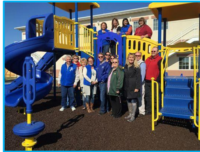
Domestic Violence Crisis Center

“No one is useless in the world who lightens the burdens of it to anyone else” - Charles Dickens