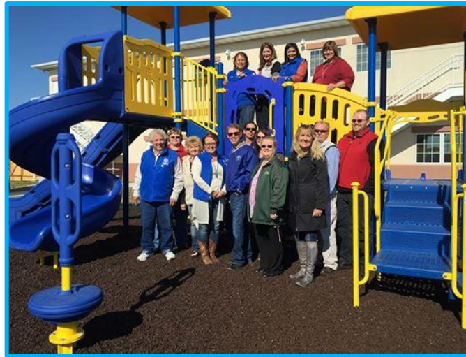
Domestic Violence Crisis Center

"No one is useless in the world who lightens the burdens of it to anyone else" - Charles Dickens